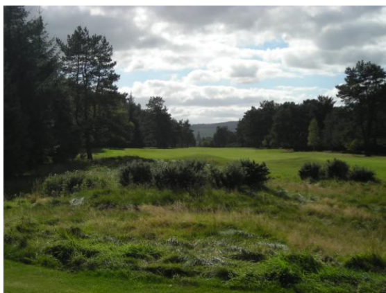
Looking across the Golf Course to Ladybank

The whole Parish is an area of rich natural beauty surrounded by rolling farmland, wooded areas and nestling at the foot of the Lomond Hills, with the river Eden running through the Parish towards the North Sea.