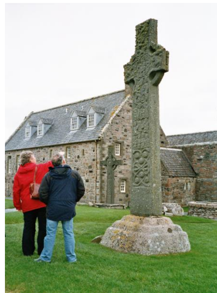
Trip to Iona 2008

Celtic prayers and readings. In 2008 we also had an Eden Project redecorating the manse and preparing the garden. For our regular studies there are 12 who attend regularly but others come along to themed evenings and outings or particular studies. It is hoped that we can increase the number of groups meeting for the studies in the future.