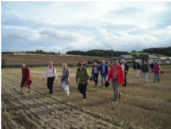
Parish walk 2009

Each year, over 200 shoeboxes are collected for the Blythswood Care Appeal for distribution in Eastern Europe.