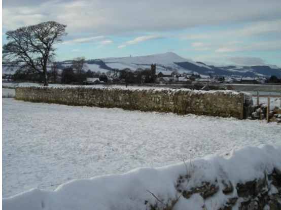
Looking across The Howe from Balmalcolm

The Howe of Fife Parish is located within the Presbytery of St Andrews and the Parliamentary Constituency of Fife North East. The main centres of population are in Ladybank, Kingskettle/Kettlebridge, Pitlessie and Collessie and there a number of other smaller villages and hamlets in the Parish. The population of the Parish is approximately 4500 and the active Church Roll is 530.