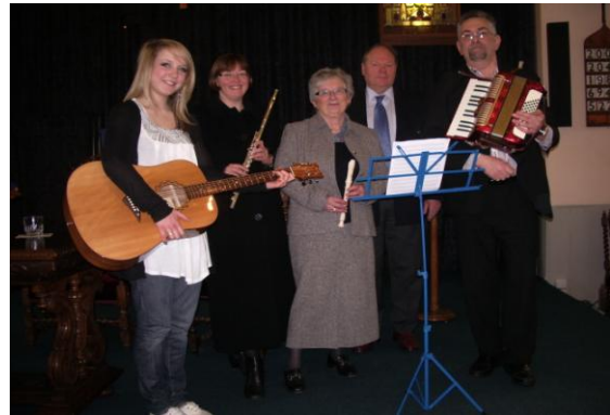
The Praise Band

Worship in the Howe of Fife Parish is enriched by the Parish Choir and by the Praise Band - two very enthusiastic and committed groups. The Praise Band (guitars, recorders, keyboard and accordion) leads the singing every Sunday. The Praise Band enlivens many traditional hymns, and along with the Parish Choir it helps introduce contemporary praise items to the congregation. The Parish Choir contributes an introit, or an anthem, on various Sundays throughout the Church year and also during Songs of Praise services. The Songs of Praise services are particular favourites as the