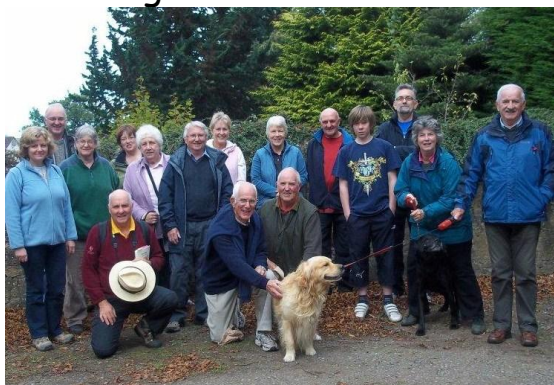
Walking in Ladybank Woods 2010

games, craft, music and story proving fun for all. Increasingly, opportunities are taken to join up together, for example, to take part in the United Harvest Thanksgiving Service and at Advent Services.. The opportunities which have been taken to reach out to young people are a credit to the adults who dedicate themselves to the task of bringing the word of God to our next generation.