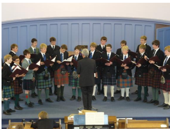
Merchiston Castle School Choir in Concert

aspect of life in The Howe. A key objective has been to use our facilities as a community resource, to bring people to events within our buildings where they might not join us at Sunday services. Events have included a Festival of Flowers, Walks across the Parish and a diverse range of concerts from local Choirs and bands. Although fundraising is not the principal aim, many of the events have raised funds for the Church or other charities.